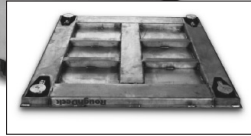
The 6" stainless steel channels provide superior protection for load cells and cable.